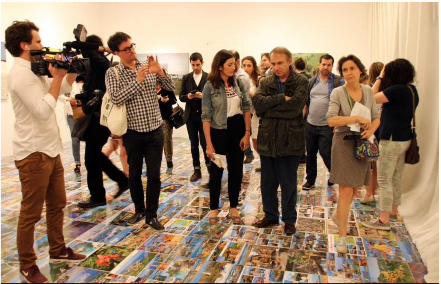
Michel Houellebecq (center right) and visitors in the gallery Venus in the Upper East Side in New York

The French author Michel Houellebecq presents a selection of his works of art in the USA for the first time.